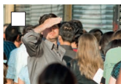
I can't find you.