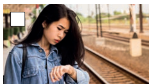
The train is late.