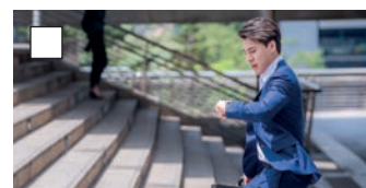
I'm running late.

B 05-15 Listen. What problems do the people have? Number the photos in 1A in the order you hear each problem mentioned.