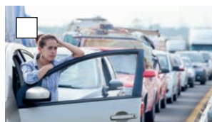
I'm stuck in traffic.