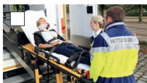
I have an emergency.