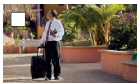
I have the wrong address.