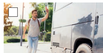
I missed the bus.